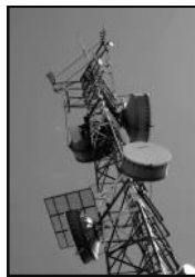
Wireless the backbone of Rural High Speed Internet

Fixed Broadband Wireless utilizes wireless radio frequencies to transmit